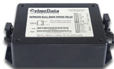
011375 Network Dual Door Strike Relay